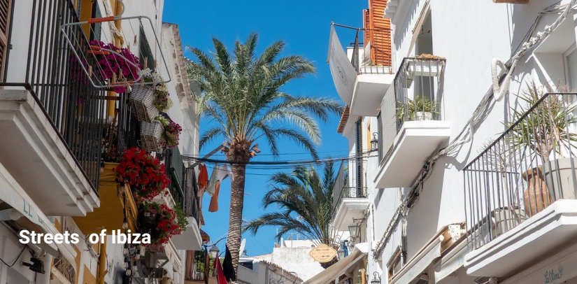
Streets of Ibiza