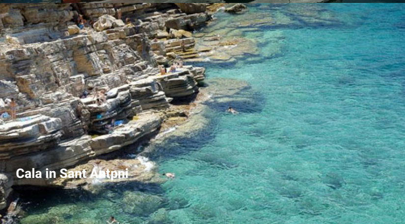
Cala in Sant Antoni