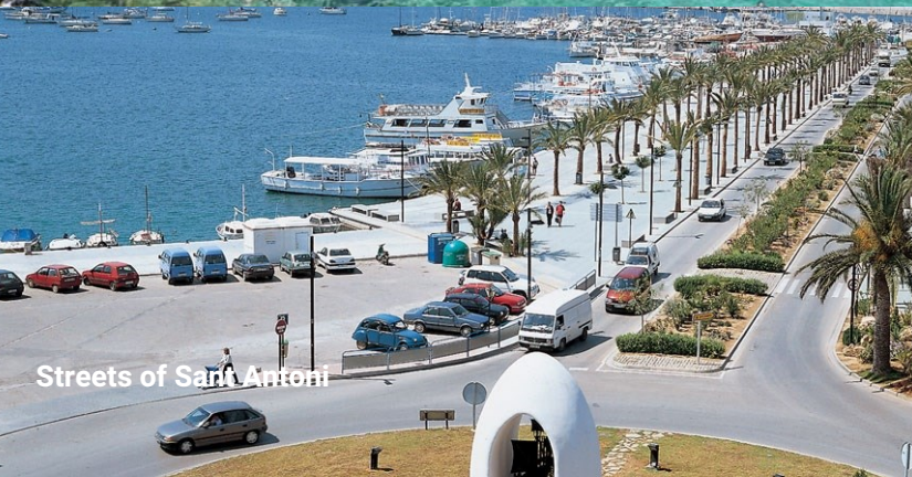
Streets of Sant Antoni