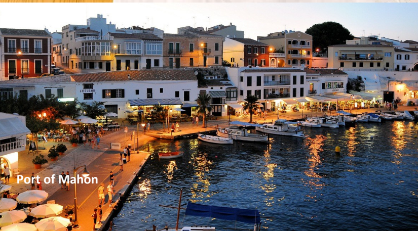
Port of Mahón