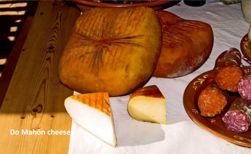
Do Mahón cheese